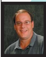
OPERATIONS MANAGER RAPID CITY, SD